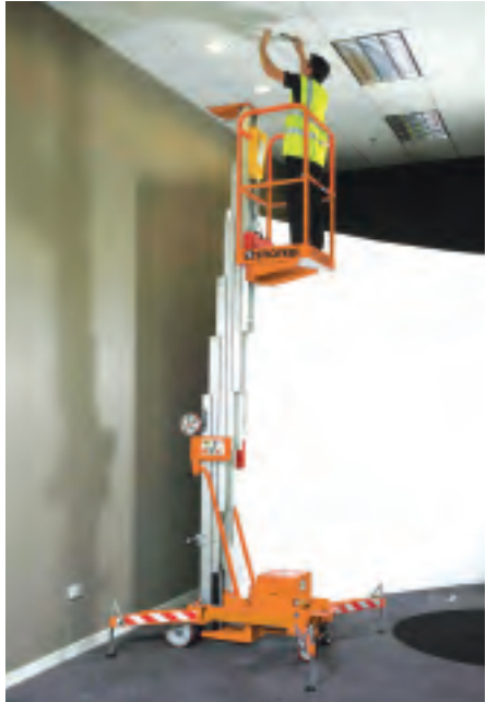
PAM21/PAM26 The PAM Series are affordable, efficient push-around mast lifts that are easy to use and easy to maintain. Compact and lightweight, the PAM Series can be easily pushed into position – and fit through a standard doorway without the need for tilting.