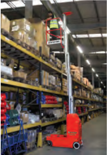
SPM20 The SPM20 is perfect for working in tight spaces, with skid steer and zero inside turning circle. Weighing just 1,800 lbs, the SPM20 delivers a platform height of 20 ft and can lift 330 lbs. The machine has a top speed of 2.4 mph and fully elevates in just 27 seconds.

Designed for contractors and facilities maintenance professionals, Snorkel Personnel Lifts are lightweight, affordable, portable work platforms for interior use. Snorkel's patented Girder Lock mast design, utilised in the UL Series, delivers superb stability and reach, coupled with excellent lift capacity.