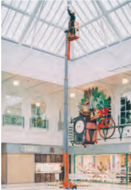
UL25/UL32/UL40 The robust and compact UL Series push-around mast lifts easily pass through a standard doorway and offer a small outrigger footprint. Our patented Girder Lock mast delivers safe and stable working heights of up to 46 ft. Non-marking castors and an easy-loader system for easy transport come as standard.